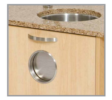
Front waste available