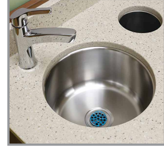
Integrated waste drop