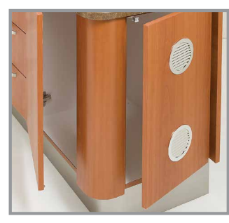
CPU storage (PFS100 shown)