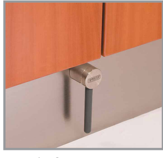
Hands-free water activation