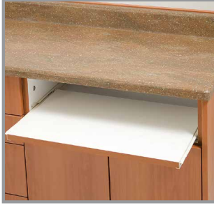
Keyboard slide-out (PFS200)