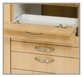
PFS400 Flip down equipment drawer