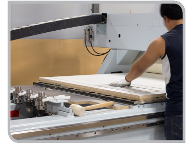
Programmable CNC-Base Nesting flatbed point to point machine; can cut a full programmed order