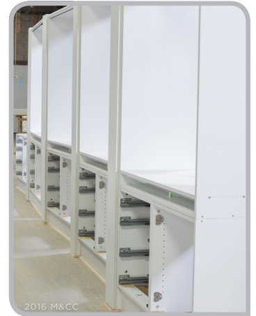
Center Island Units in the assembly department

MCC: From our experience, we would say that the end result of getting exactly what you want is priceless. So from that standpoint, custom offers the best value. With standard cabinets, everything is pre-determined - size, color, finish, pricing. With custom, your pricing will vary, depending on your choices.