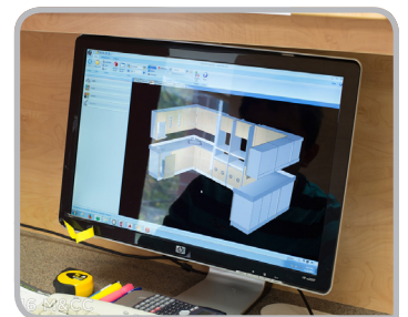
A rendering of a custom sterilization center in the design and quoting department