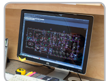
Planning a project in the design and quoting department