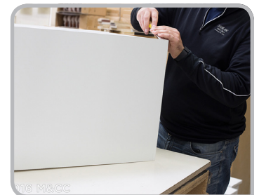
Taking care of every detail before entering the assembly department

MCC: We put dentists at the centre of what we do - we know that meeting the dentist's needs sometimes requires a custom solution and sometimes a standard solution. Standard dental furniture and cabinets are usually quicker to get, and it's easier to see exactly what you are getting. We have the pictures, sketches and pricing ready for you. With Custom dental furniture and cabinets, a dentist has lots of options. It can take longer to decide on all these options. We turn around pricing and sketches as quickly as possible. And as we've said above, custom has the power to give the dentist exactly what they are looking for, even if it means a little more time than standard options. Offering custom AND standard dental furniture and cabinets means that we can satisfy all requirements.