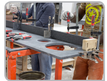
MCC's Solid Surface section; attaching a backsplash to the top

MCC: When you are just starting your practice, space will likely be the main consideration - how big is your space and what furniture and equipment do you need for your practice? Your office space may fit some of the standard dental cabinets comfortably. In this case, you may look for customization on the drawers and handles on the units - to meet your needs and preferred style. If space is a challenge, then custom may be the way to go because you can adjust the size of your key cabinets - like a sterilization unit - to fit your space.